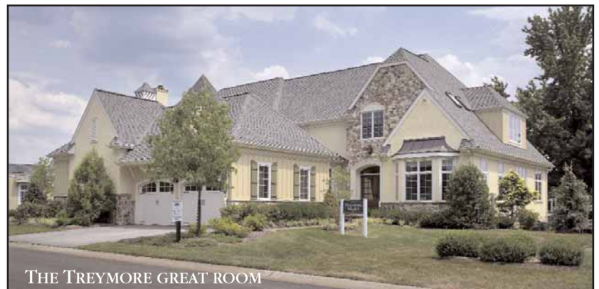
THE TREYMORE GREAT ROOM